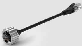
Cable for PoE