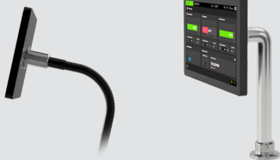
Gooseneck mount and tube attachment