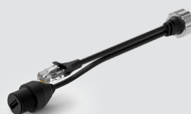
Cable for PoE and Ethernet/USB